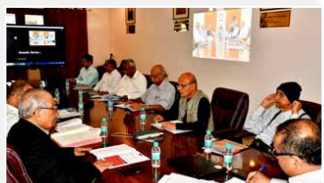
Meeting of Board of Directors of XIME Society on 11 September